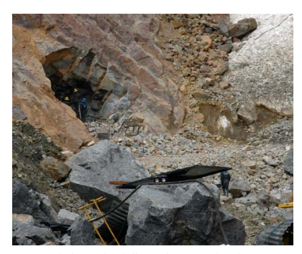
Five weeks later, the drill is no longer in the glacier (although the previous hole is visible in the ice) and the drilling is still well within 10 meters of the edge of the glacier. Date: May 9 2011.

The liquid effluent from these operations enters the upper reaches of the Ocshapata watershed which then flows to the Achin River and finally passes through a rich agricultural zone on the Peruvian coast known Pativilca before it enters the Pacific Ocean. The Ocshapata River lies within the territory of the community of Pacllon, a small ranching community located in the district of Bolognesi. In December of