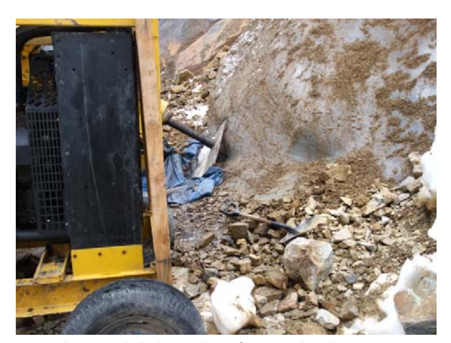
An exploration drill obviously perforating the glacier.WGS84 UTM Zone 18s 282555E 8861436N —altitud 4848. Date: March 29 2011.

In Peru the Supreme Decree 020-2008-EM, article 31, subsection 2, states that mining activity cannot be realized "on glaciers or within 100 meters of the border of a glacier" (translation mine). Clearly the mine violated this law. Additionally the Raura Mining Company is undertaking its exploration activities without the proper authorization from the National Water Authority (ANA) for the use of water. Furthermore, according to the MINAM report, the Raura Mining Company is not complying with its environmental management standards as outlined in their own Environmental Impact Statement (EIS) for the exploration project (the EIA was authorized by the Ministry of Energy and Mines through the Resolution 004-2010-MEM/AAM). These observations make it clear that CIA Mineria Raura S.A., the company responsible for the Diablo Mudo Mining Project, are infringing upon laws that regulate mining activity in Peru.